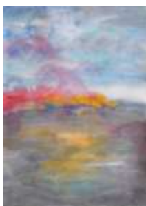
Distant fires , 60x42.5cm Ink of China on rice paper, 2013