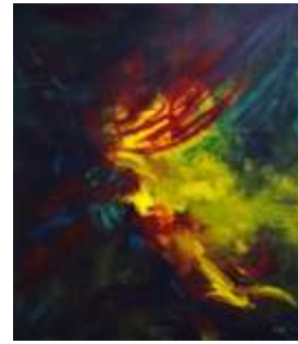
Jupiter meditation , 171x157cm, Oil on canvas, 2005