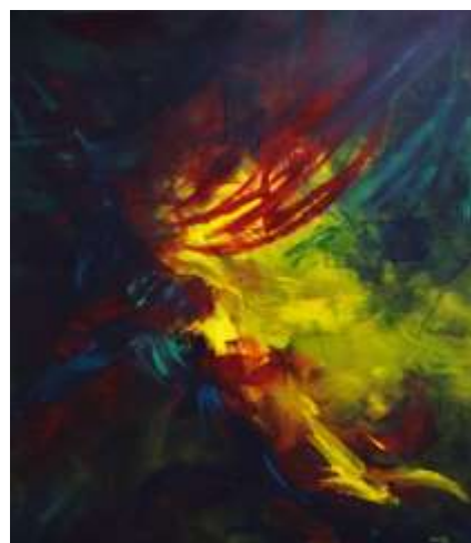
Jupiter meditation, 171x157cm, oil on canvas, 2005

THIS EXHIBITION IS PART OF FRANCE-CHINE 50 www.france-chine50.com