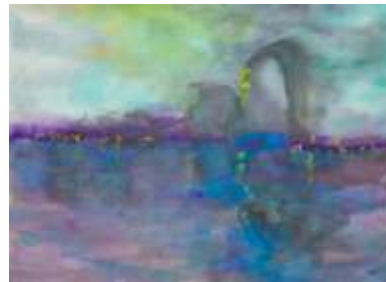
Songe nocturne , 49x69.5cm, Ink of China on rice paper , 2013