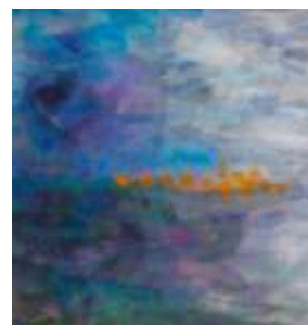
Last night , 68x64cm, Ink on rice paper , 2013