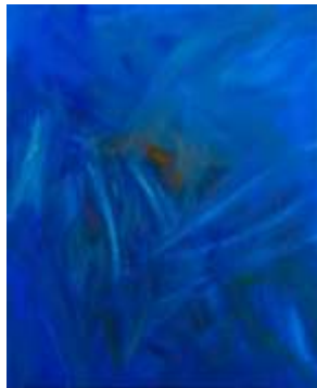
Lonely tempest , 46x38cm Oil on canvas, 2011